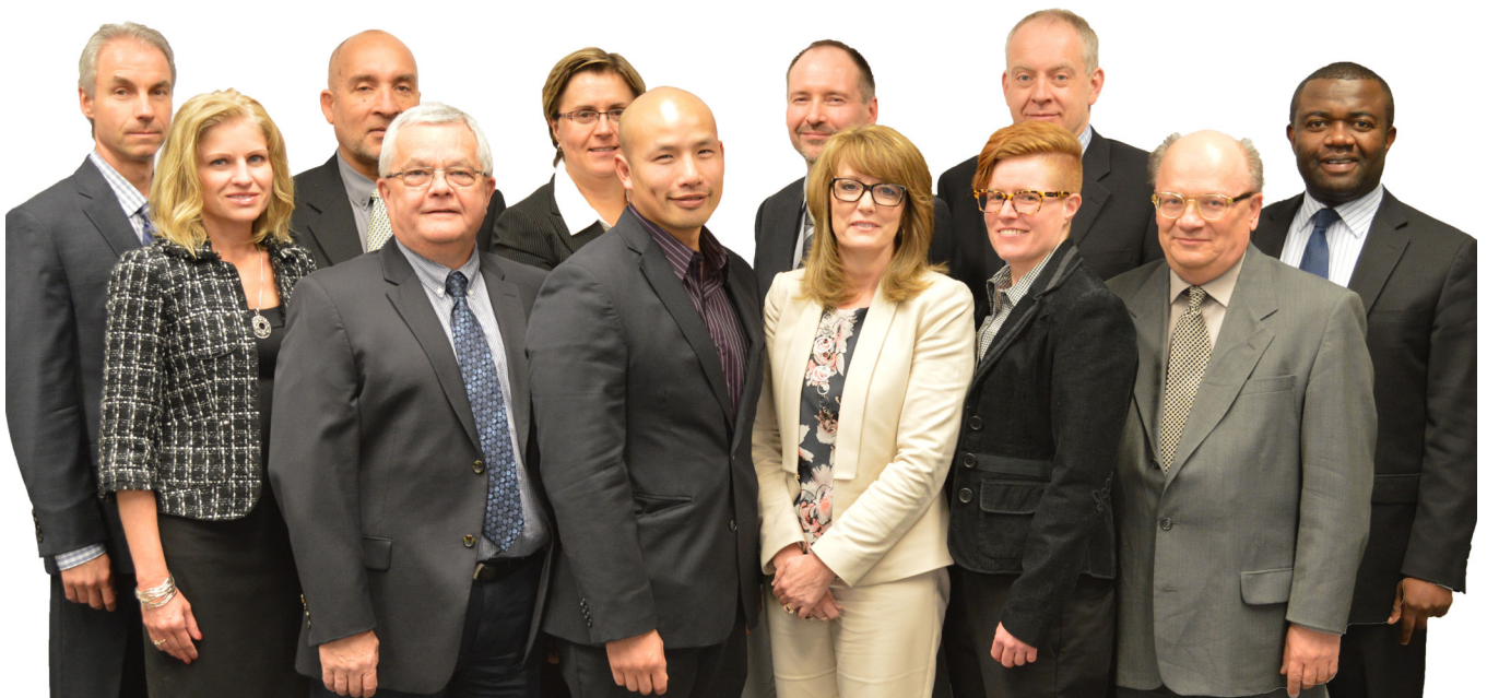
FCAA Management Team.