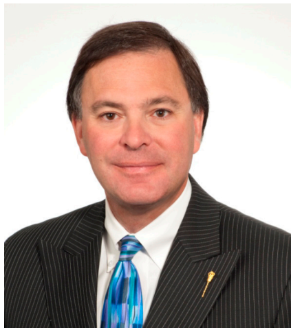
Her Honour, Honourable Vaughn Solomon Schofield, Lieutenant Governor of Saskatchewan