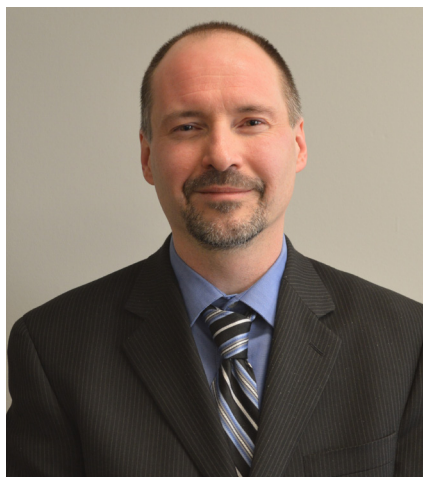
Honourable Gordon Wyant, Q.C. Minister of Justice and Attorney General