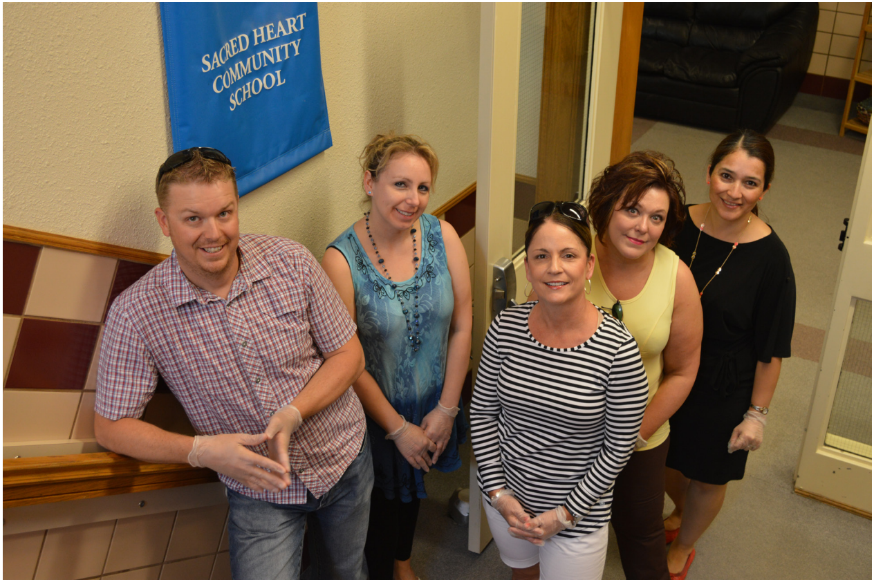
FCAA staff members volunteer with Chili for Children.