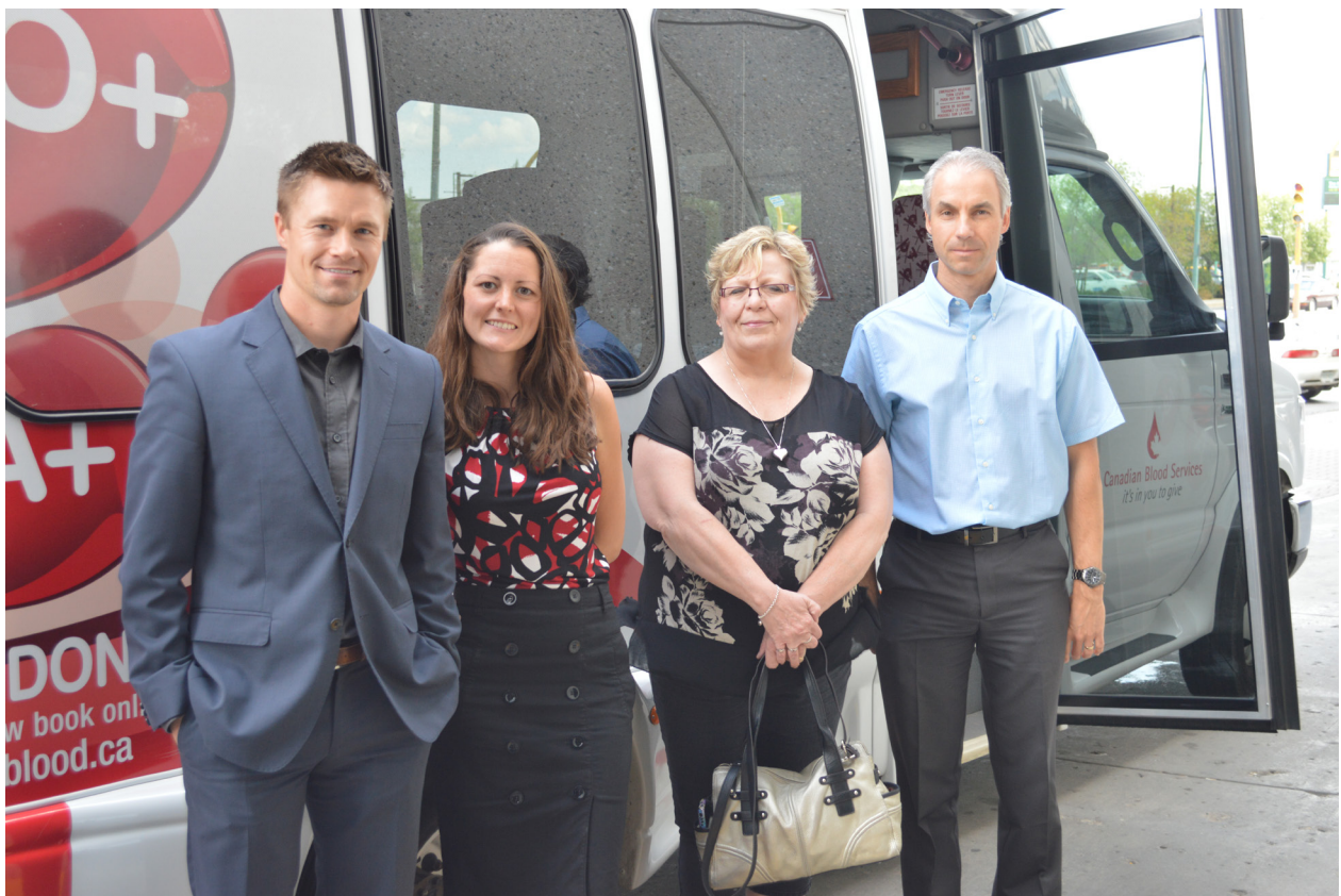
FCAA staff members volunteer with Canadian Blood Services.